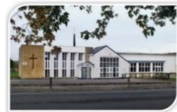
Queens Road in the Community

To reflect God's love in all we do so that others may be encouraged to find faith in Christ.